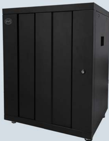
B-Box Pro 13.8