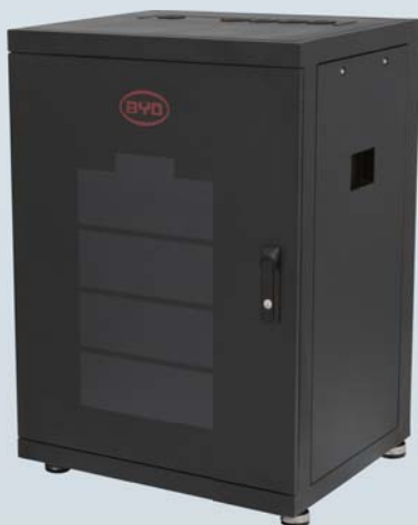
B-Box Pro 2.5~10.0